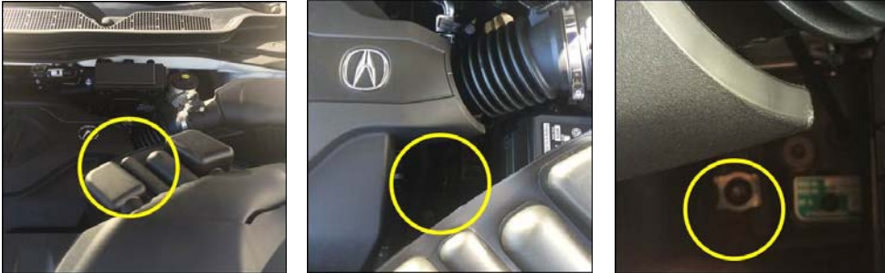
General location of Park-Lock in engine compartment